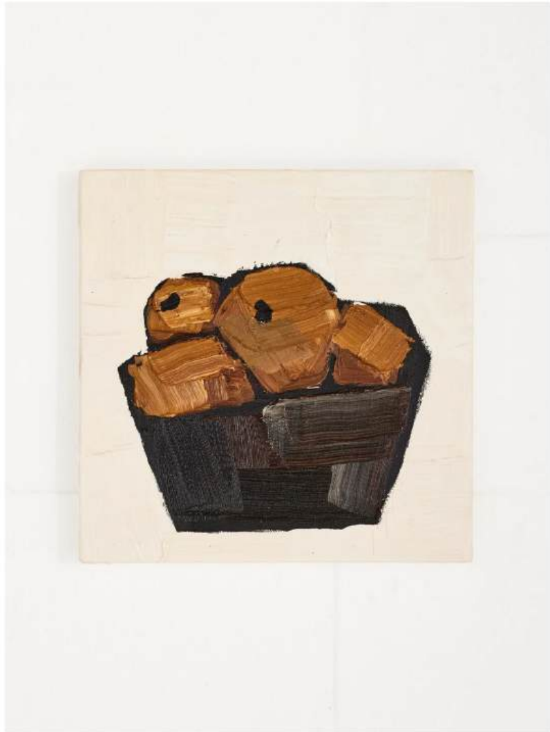
Mmangaliso Nzuza 'Still Life III' Oil on Canvas 11.8 x 11.8 inches / 30 x 30 cm