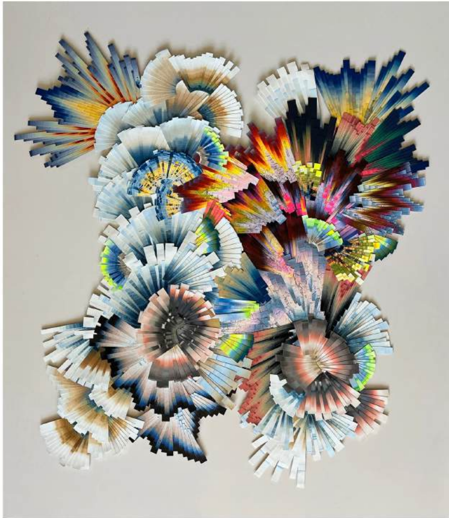
Lyndi Sales 'This is Merely a Blip II' Paper Collage 44 x 51.1 inches / 111.8 x 129.8 cm