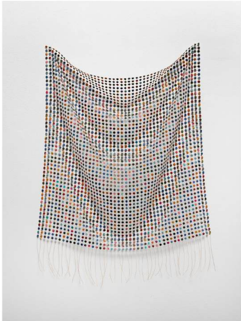
Bonolo Kavula 'Paint the Sky Blue' Punched Schweshwe, Thread & Acrylic on Canvas 17.3 x 24.4 inches / 44 x 62 cm