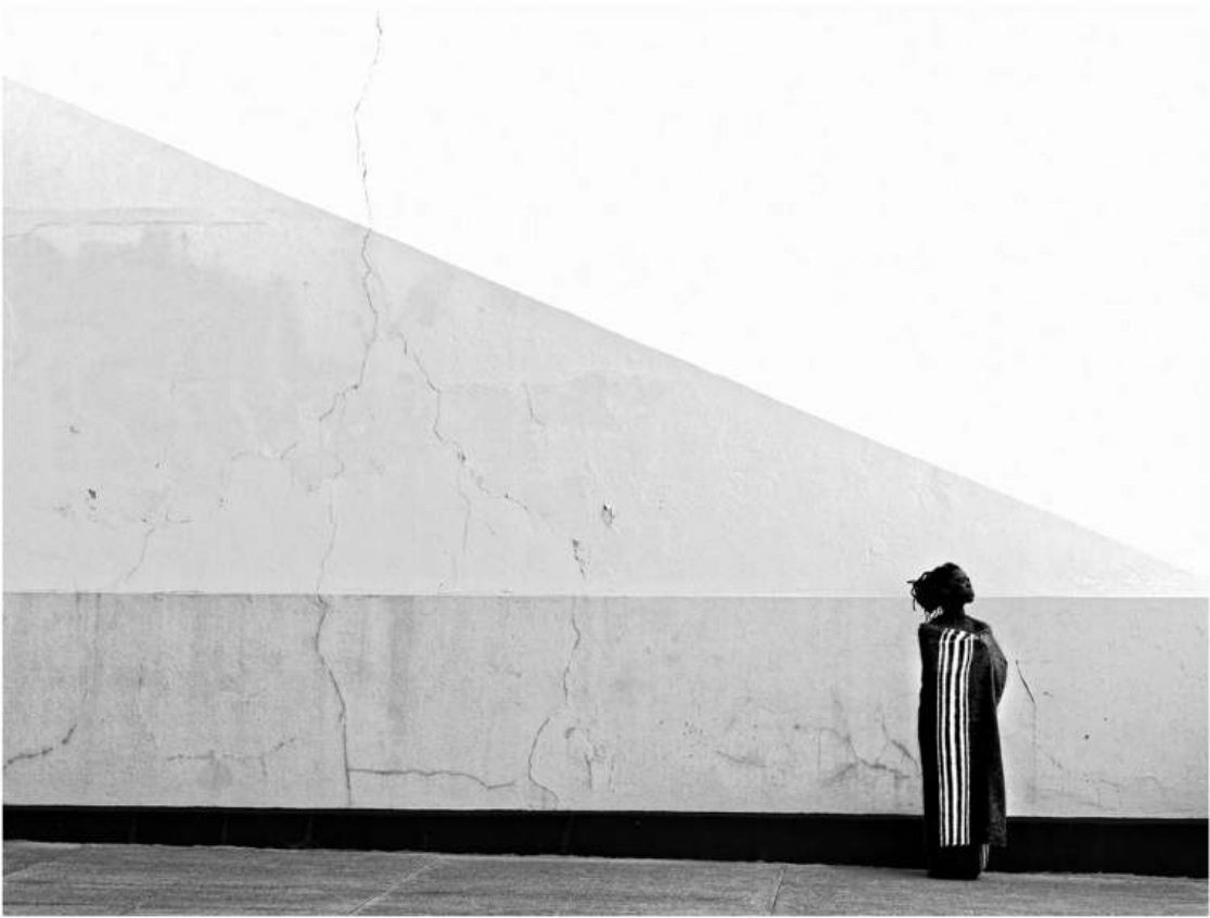
Zanele Moholi 'Bayephi III' Fibre Silver Gelatin Print 35.6 x 27.8 inches / 90.5 x 70.5 cm