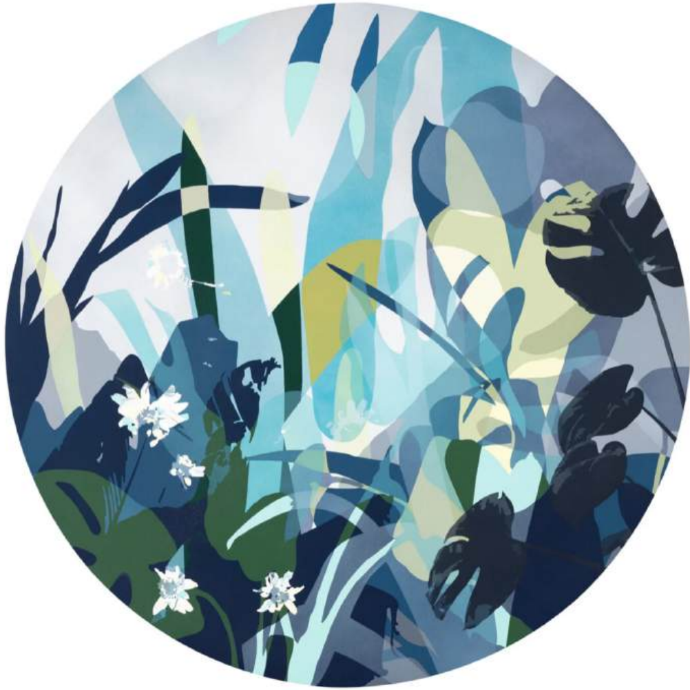
Neill Wright 'Waiting for Spring' Acrylic on Canvas 59 inches / 149.9 cm