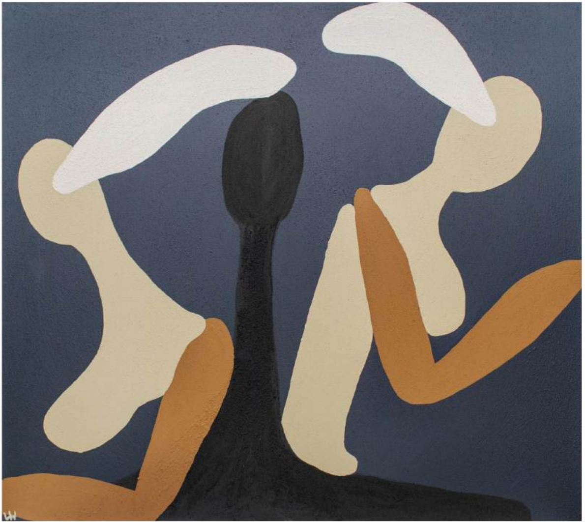
Lulama Wolf 'Amawele Amathathu' Acrylic & Sand on Canvas 39.4 x 35.4 inches / 100 x 90 cm