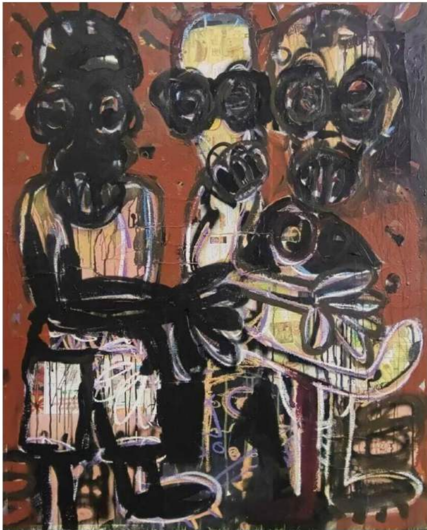
Aboudia 'La Pose' Mixed Media on Paper 48 x 59.1 inches / 122 x 150 cm