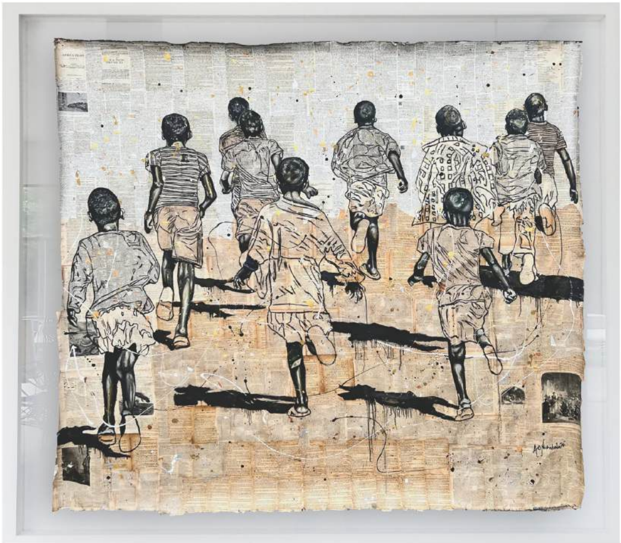
Andrew Ntshabele 'Tales Woven Together III' Oil on Mixed Document 78 x 72 inches / 198 x 183 cm