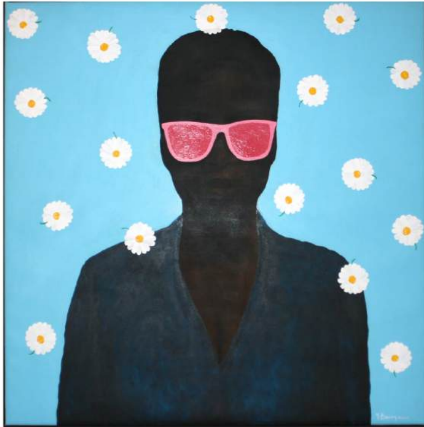
Barry Yusufu 'The Bold Ones II' Charcoal, Coffee & Acrylic on Canvas 40.2 x 40.2 inches / 102 x 102 cm