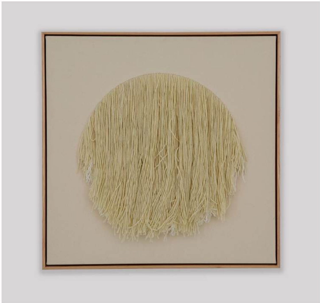
Dudu Bloom More 'Clinging onto Something I Need to Let Go' Hand Stitched Acrylic Wool on Canvas 23.6 x 23.6 inches / 60 x 60 cm