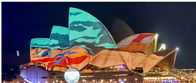
Mid Year Dinner