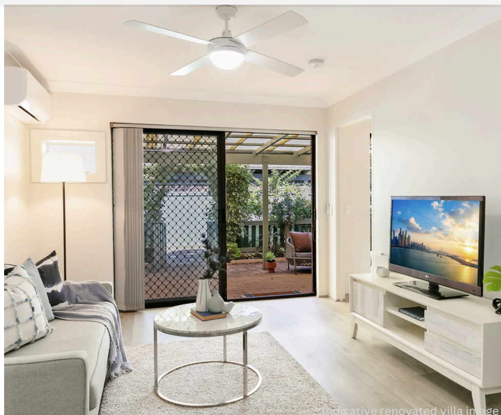
Indicative renovated villa image