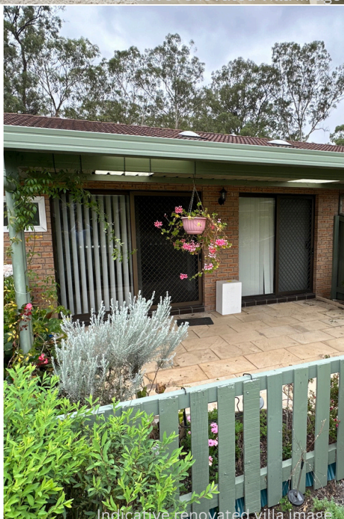
Indicative renovated villa image

Windsor Country Village is independent living in a tranquil, garden setting, offering privacy yet companionship in a secure and pleasant environment. This newly refurbished Villa gives you the privacy and seclusion of your own home with the freedom to enjoy the village facilities.