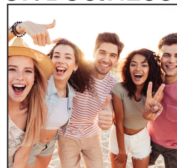
BETTER TRAVEL EXPERIENCES

Manage hospitality, clean-up, and maintenance with proven systems and technology