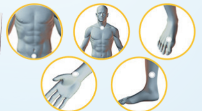
• Patented form of phototherapy