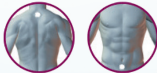
• Patented form of phototherapy