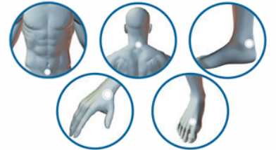
• Patented form of phototherapy