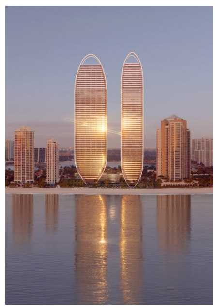
St. Regis Sunny Isles Beach.

Fortune International Group and Château Group have officially announced the highly-anticipated St. Regis Residences in Sunny Isles Beach, an oceanfront ultraluxury residential development comprised of two standalone 62-story towers planned to rise at 18801 Collins Avenue. Designed by global architecture firm Arquitectonica with interiors by São Paulo-based Anastassiadis and landscaping by EDSA, the development will be situated on 435 linear feet of