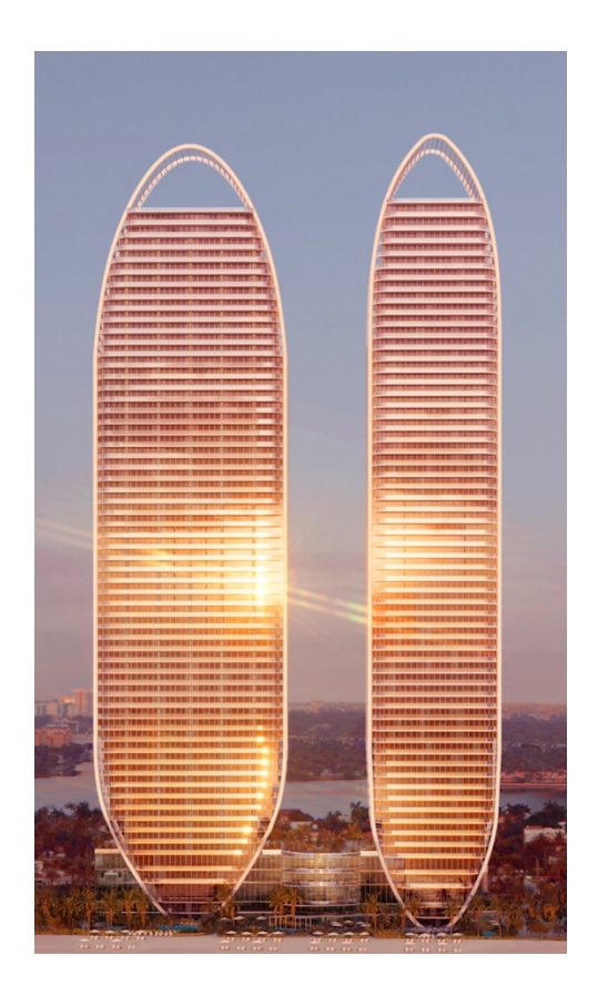
St. Regis Sunny Isles Beach. Rendering courtesy of DBOX.

Residences, Sunny Isles Beach, Miami, we couldn't be more confident in the future and growth of South Florida."