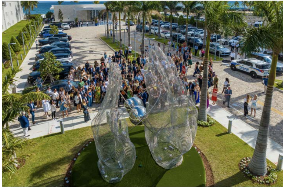
Our Nucleus by Lorenzo Quinn