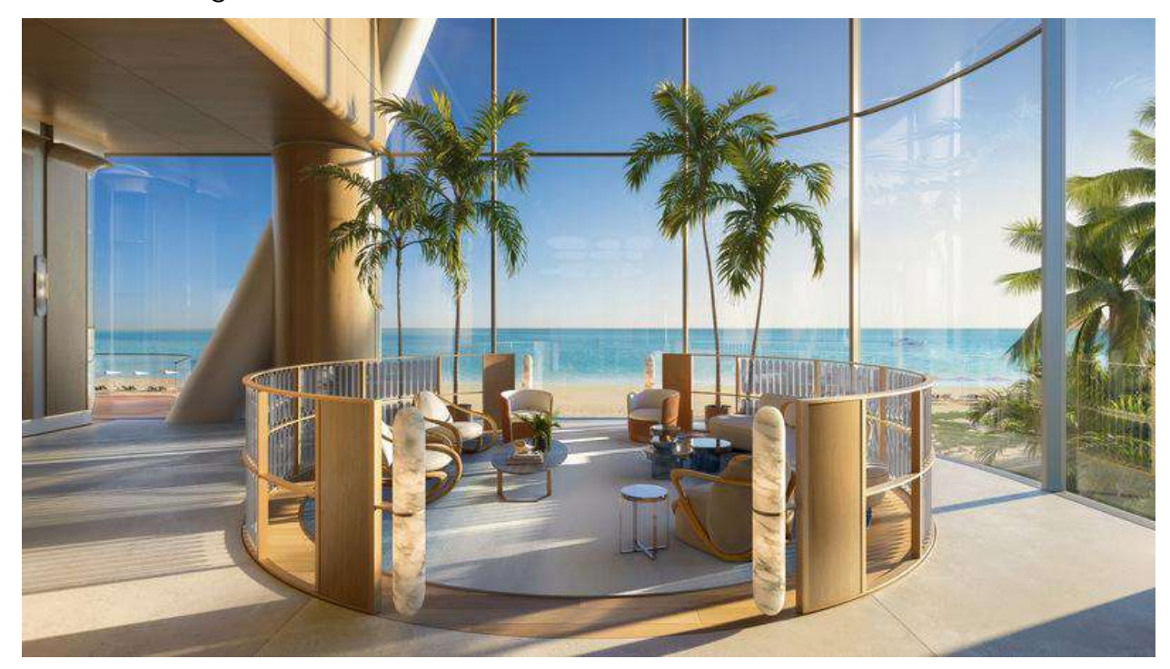
June 27, 2023 Salon Privé Magazine

With its breathtaking design, panoramic views, and impeccable St. Regis service, the residences offer an unparalleled living experience that captivates from the very first glance.