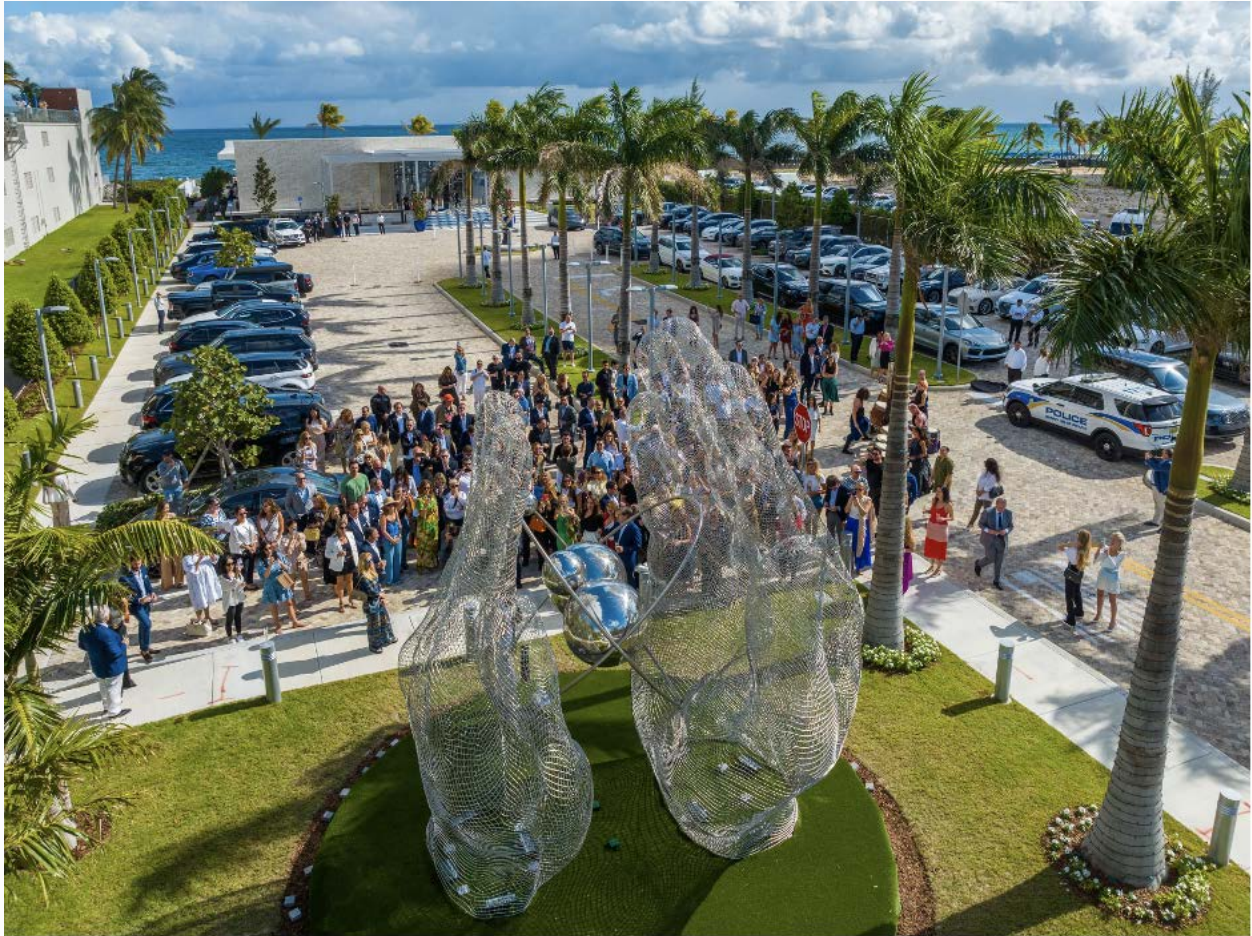
Our Nucelus by Lorenzo Quinn