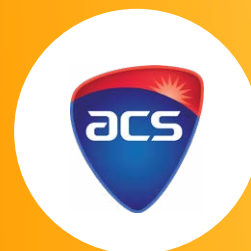
Australian Computer Society