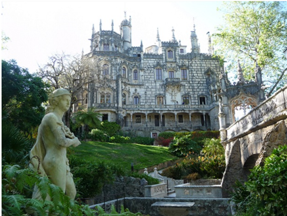
Quinta da Regaleira, Sintra, Portugal