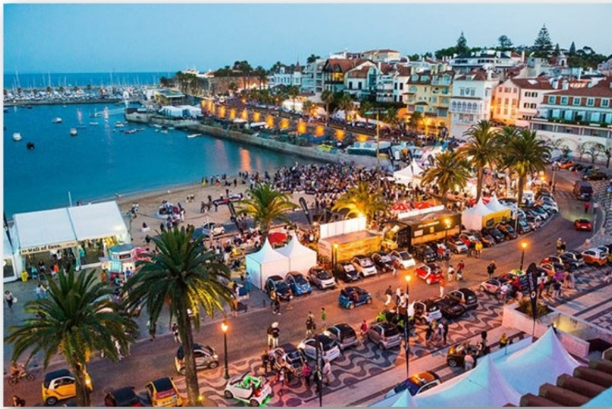
Town of Cascais at night, on the Portuguese Riviera, Portugal