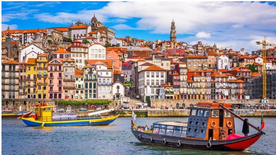
Douro River, Porto, Portugal ( our hotel on the bank )