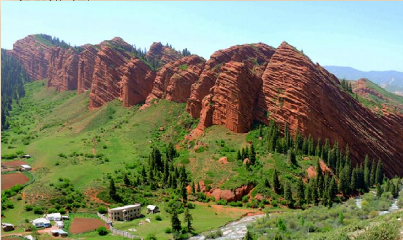
Jeti Oguz, the Seven Bulls

Today we'll be amazed to reach the gigantic bright red-orange rocks of Jeti Oguz, the Seven Bulls. The best view is an overlook called the Seven Bulls' Calf. We then drive along the shimmering Issyk Kul , the second largest alpine lake on earth after Titicaca. We'll see the snow-capped range of the mighty Tien Shan Mountains of Heaven.