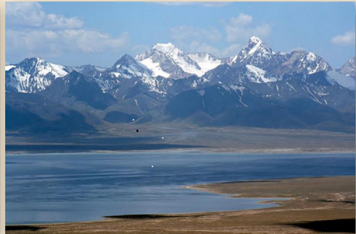
Issyk Kul Lake and Tien Shan Mountains