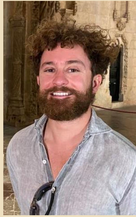
Edward Windsor “Eddy Downpatrick”