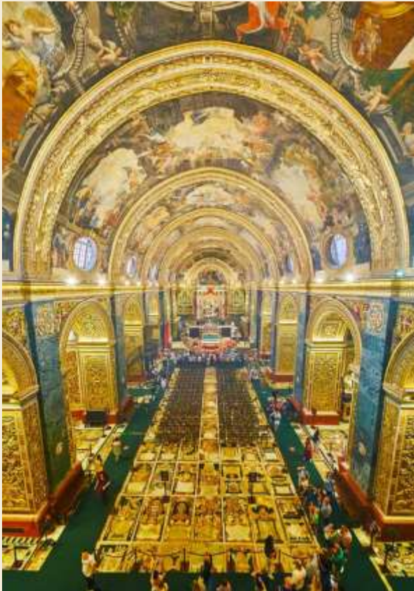
St. John's Co-Cathedral

After lunch, explore Valletta with a walking tour to St. John's Co-Cathedral, the Valletta waterfront, Saluting Battery at 4pm (below) Upper Baraka Gardens, Casa Rocca Piccola Palace, Grandmaster Palace Courtyard, and a selection of pubs along Straight Street. Dinner in Valletta.