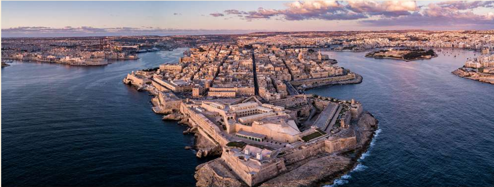
Valletta, Fort St. Elmo in foreground

So come with us to enjoy Malta to the hilt – and learn how Western Civilization began here thousands of years ago... and how a few centuries ago, here is where Western Civilization was saved from oblivion.