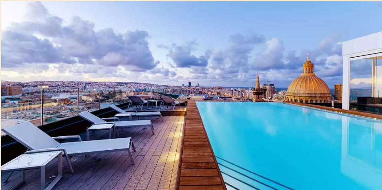
Rooftop infinity pool of Embassy Valletta Hotel

After we check into our hotel we'll have time to rest and relax until we all meet this evening for our Welcome reception and dinner.