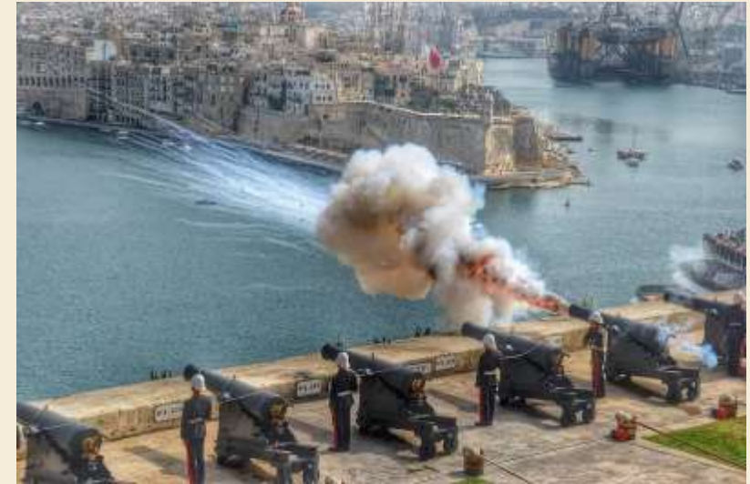
Saluting Battery ceremony at 4pm..