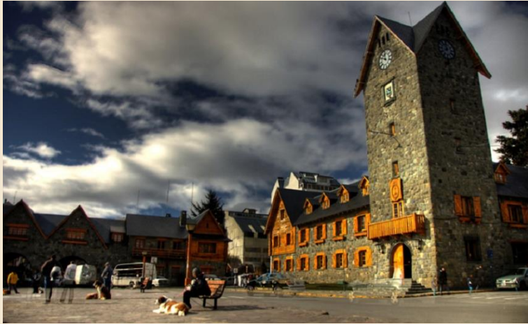
Bariloche's Civic Center

We're back by mid-afternoon for a historical walking tour of Bariloche, with its nickname of "Little Switzerland of the Andes," as it looks like a Swiss alpine town built of wood and stone. The Swiss immigrants also have made Bariloche famous for dreamily delicious chocolate. There's even an entire street lined with chocolate stores, factories, and museums.