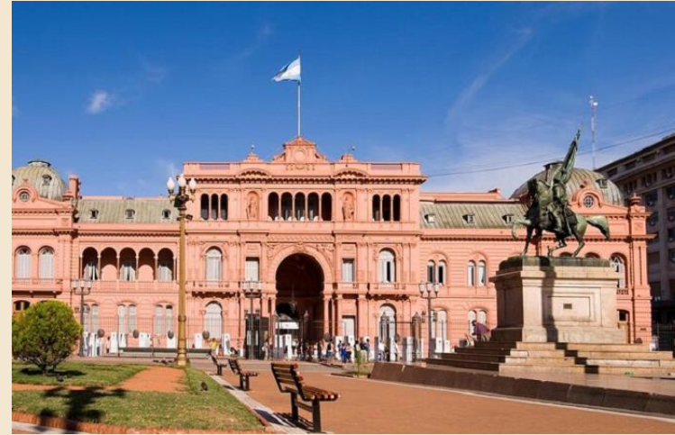
Casa Rosada, Argentina's White House

Tonight we'll enjoy a sumptuous dinner at a famous steakhouse!