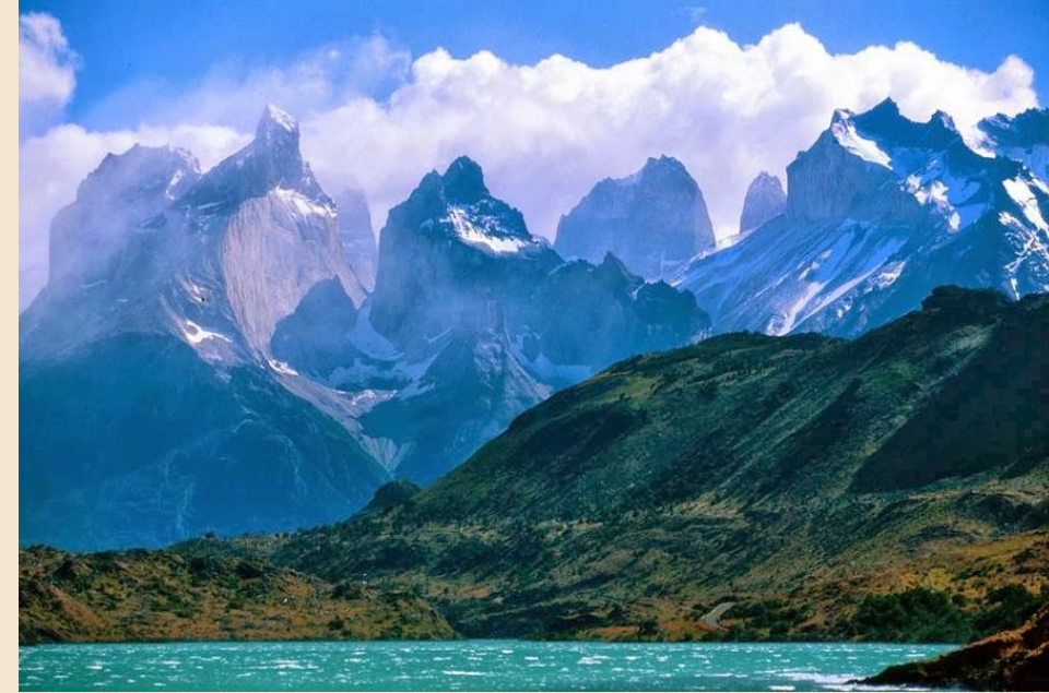
Torres Del Paine

The second day to never forget being here. A full day excursion across the pampas (we'll see lots of wild guanacos) and into the Andes reaching the jaw-dropping Torres del Paine . They seem out of a science fiction movie, yet they are stunningly real.