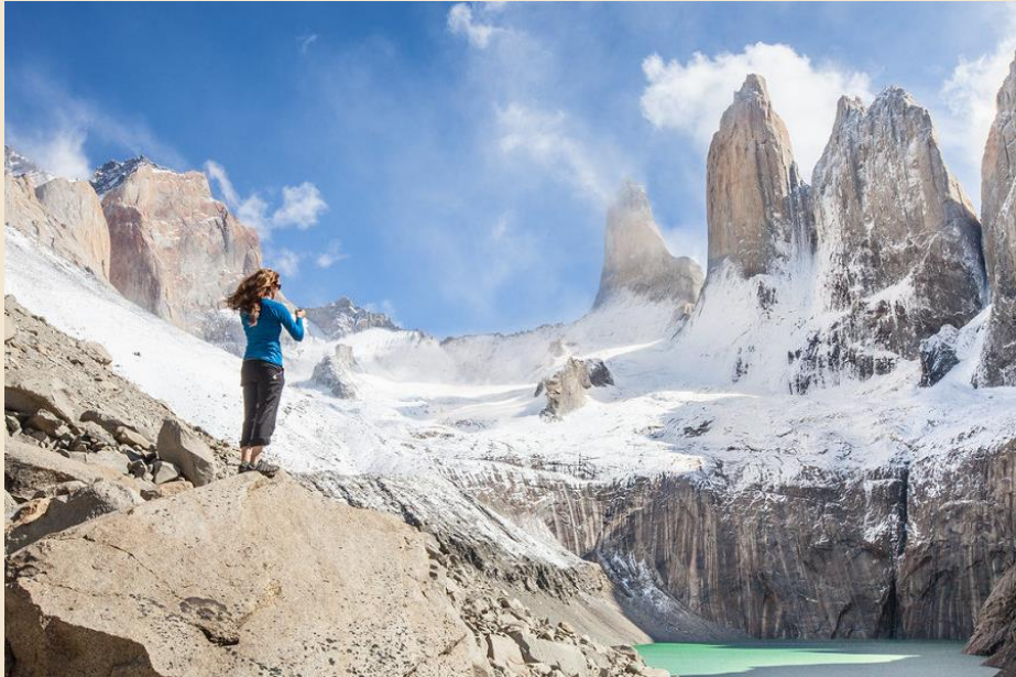
The Paine Towers