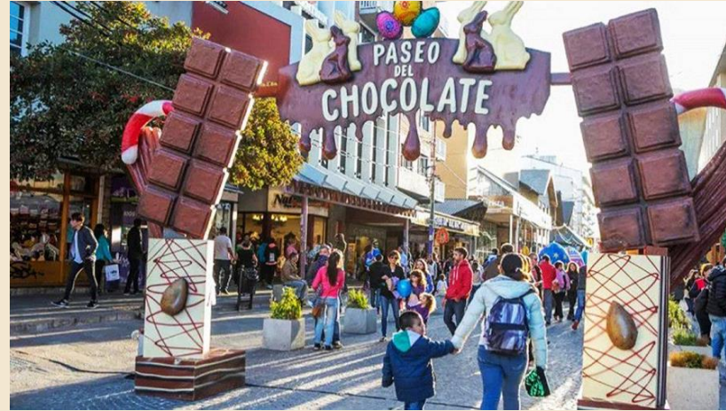
Bariloche's chocolate street, Avenida Mitre