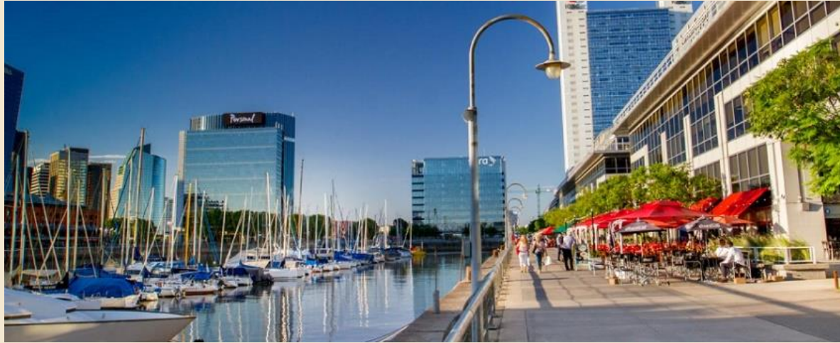
Puerto Madero Promenade along the Rio de la Plata