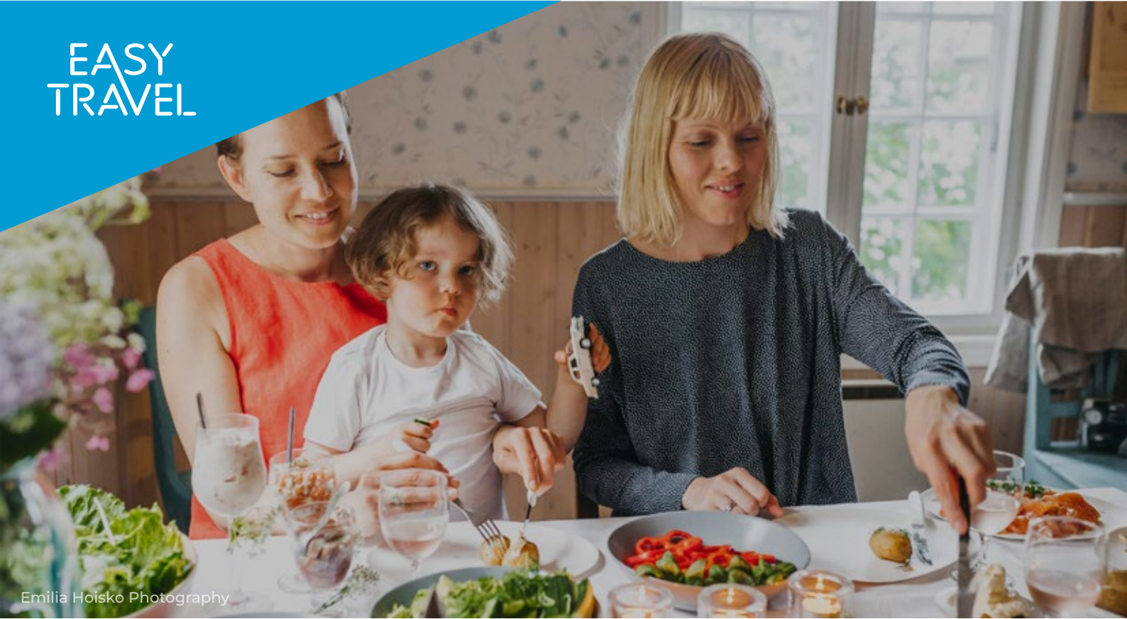
Emilia Hoisko Photography