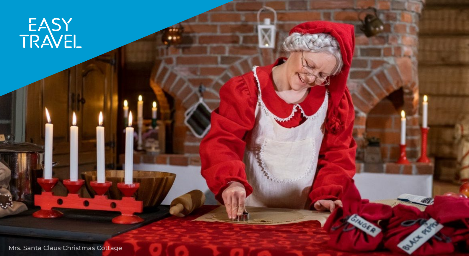
Mrs. Santa Claus Christmas Cottage