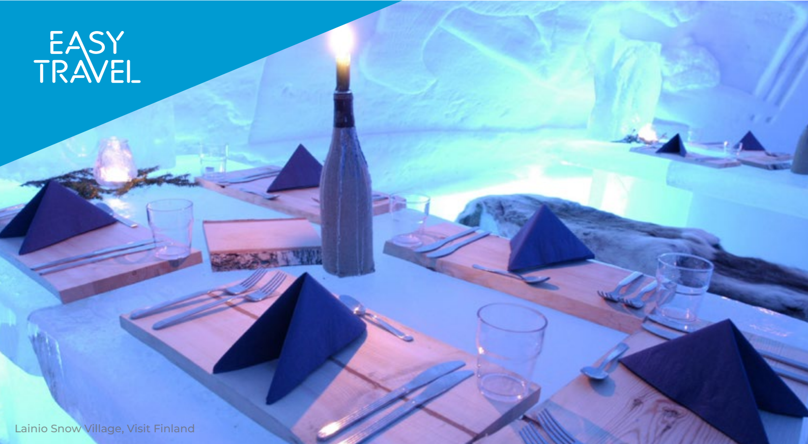
Lainio Snow Village, Visit Finland