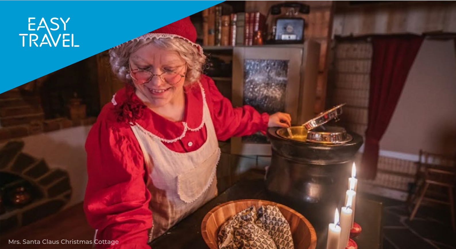
Mrs. Santa Claus Christmas Cottage