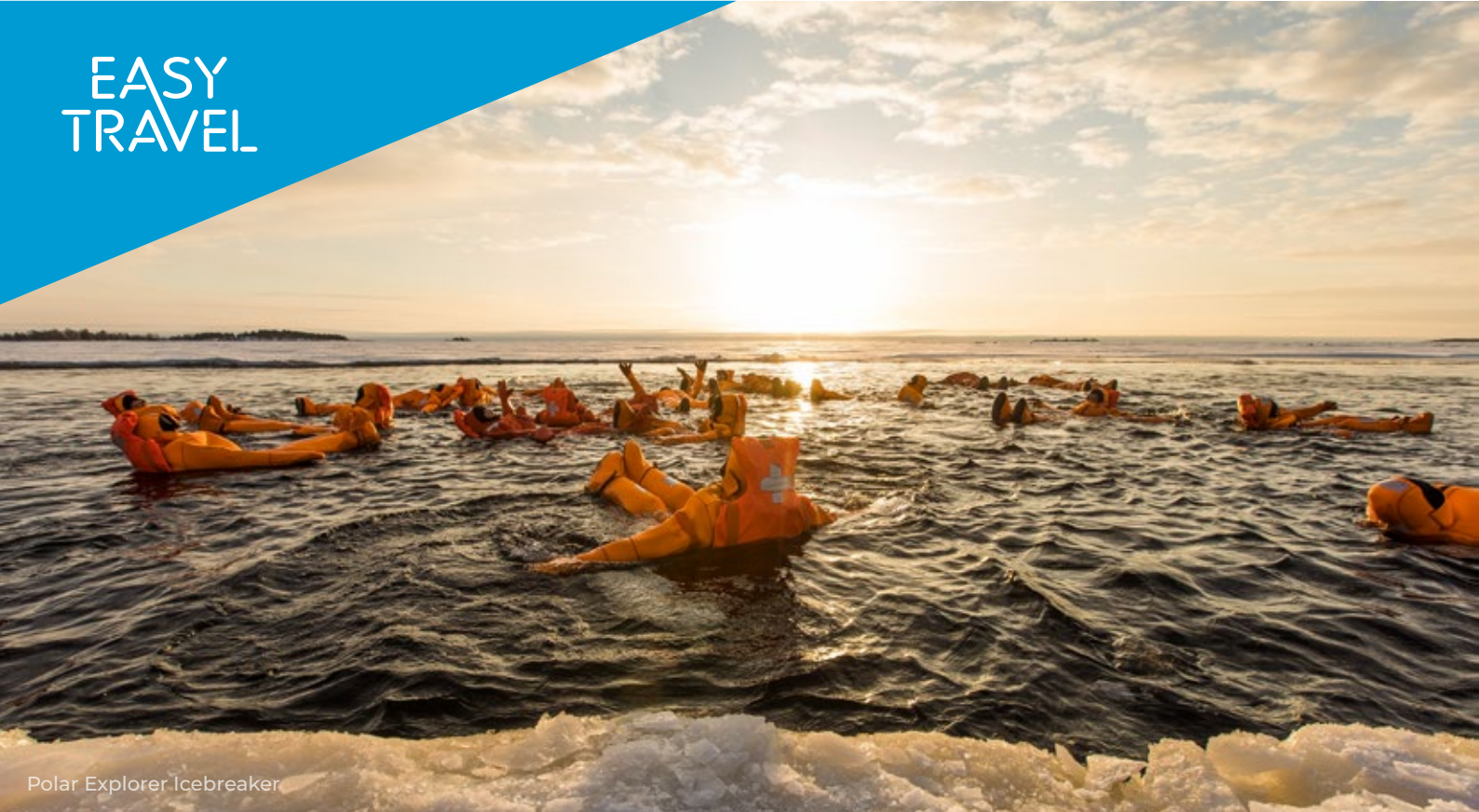
Polar Explorer Icebreaker