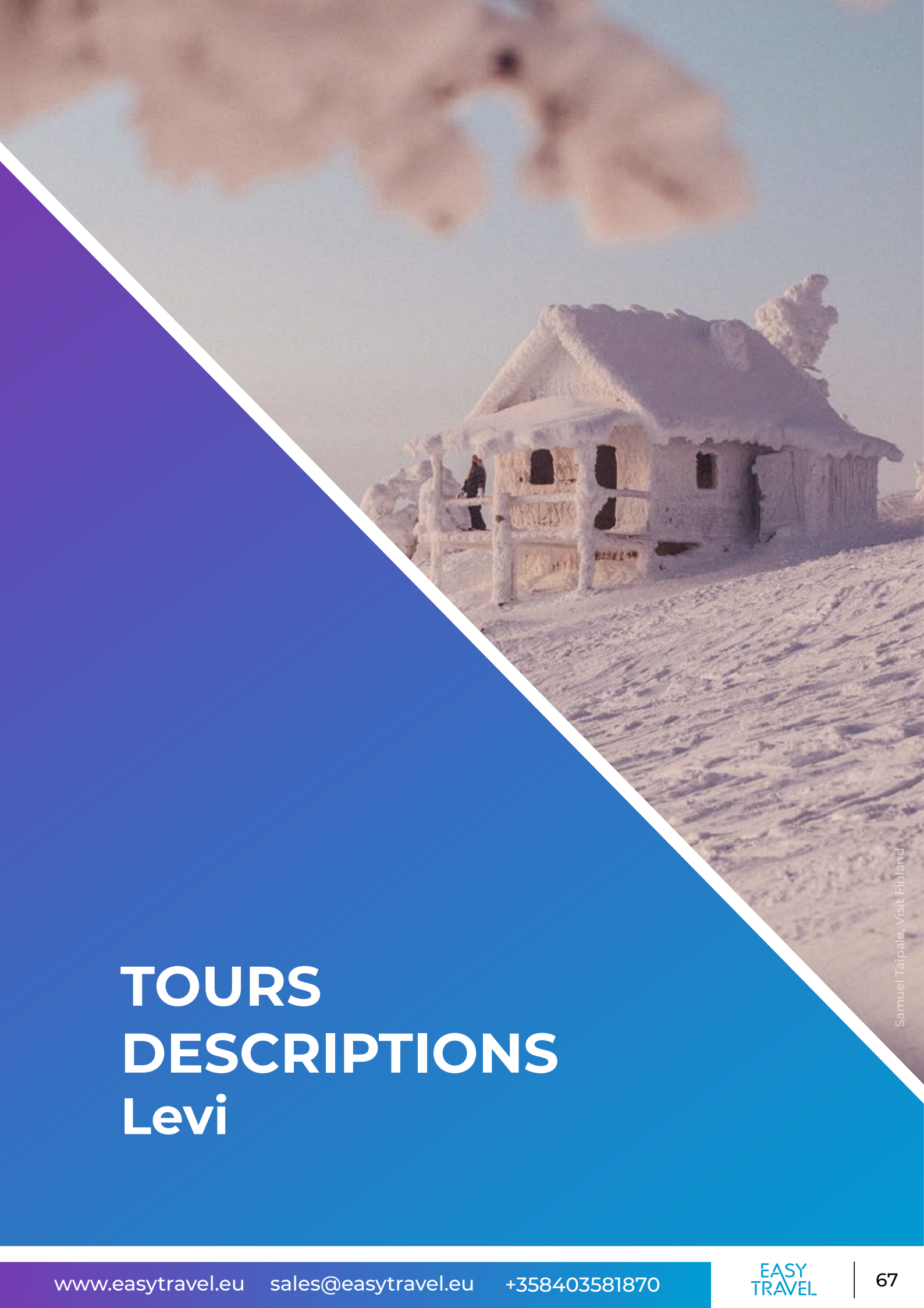
Samuel Taipale, Visit Finland