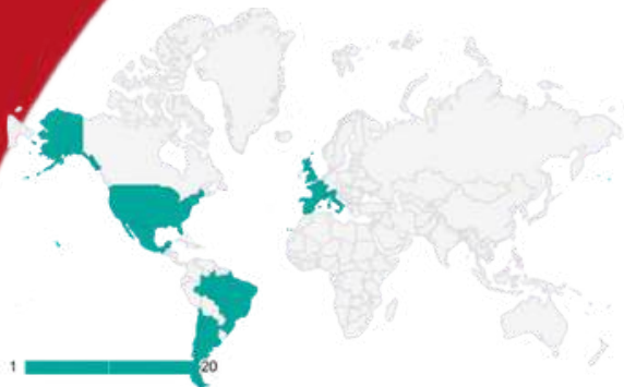
Impacts per language