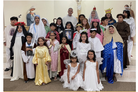
Children's Rosary (above), Apóstoles de la Palabra (below)