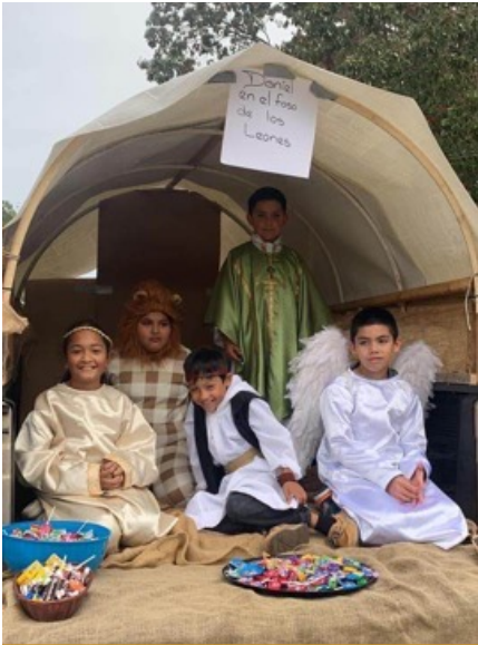
Scenes from Trunk or Treat

through the Scriptures. There are about 40 members in the chapter in the mother church and now another 12 in the Mission. The Diocesan Director is a parishioner at ICC.