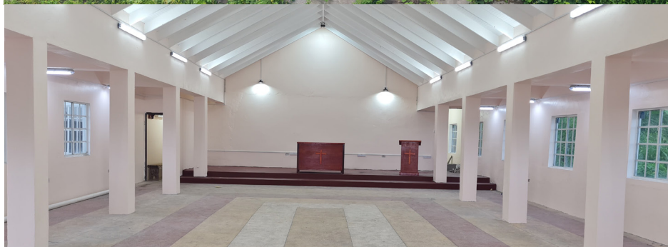
“After” images of repairs done to the Church structure