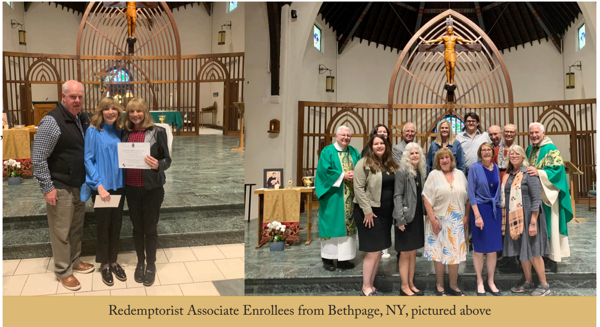
Redemptorist Associate Enrollees from Bethpage, NY, pictured above