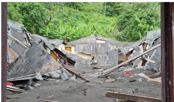
“Before” image of the destruction of the Church structure

Previous articles have told the story of the extensive damage there and the work of reconstruction. The raising of the new roof has now been accomplished, as illustrated in earlier issues of this newsletter. Dedicated members of the community and beyond, who have risen to the task of rebuilding, have been highlighted and commended. Many hands have