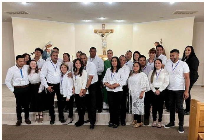
Participants of Marriage Retreat

On the weekend of October 15-16, Immaculate Conception Church in Clinton, NC, offered to our parishioners and those of San Juan Mission in Ingold its first Retreat for Married Couples (whether by canonical, civil, and even “common-