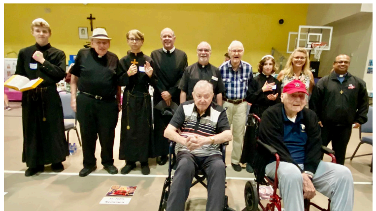
All Saints Day Celebration

Sacred Heart School celebrated All Saints Day with each grade. Pre-k through eighth grade exhibited saints. The eighth-grade students acted as living saints – that is they memorize a brief history of a Saint, including Redemptorist Saints. On their hands they had green and red stick-on buttons. You pressed the green button, and they recited a brief history of the