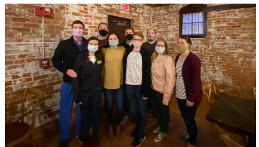
Young adults from St. Mary's, as well as the parish in Lima, meet monthly for fellowship.