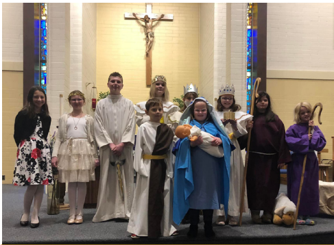
Faith formation students who participated in the Christmas play after Mass.