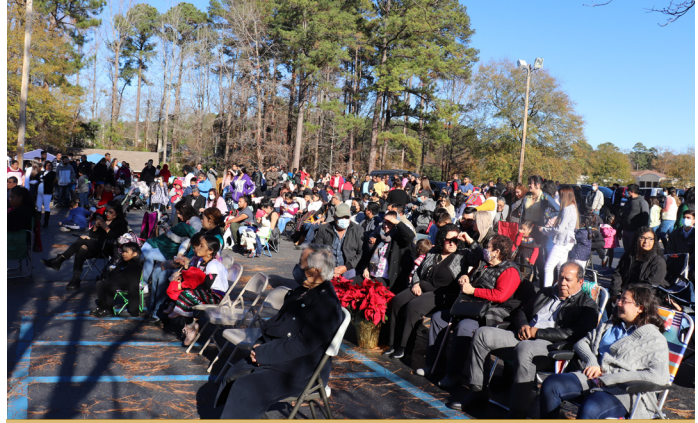
A crowd gathered outside for Mass.

from Iraq. We have small group of Vietnamese and Indian families as well as our large contingent of Hispanics. Our parish is one of thirty-two churches and two synagogues in the Columbia area who are members of the Midlands Organized Response for Equity and Justice or MORE Justice.