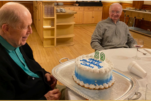
Partners in Mission, Boston, kicked off their first meeting in celebration!