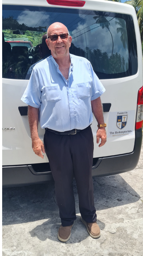
"Give thanks," is an expression often heard in the Caribbean. The phrase is used to express appreciation not only to a person who may be offering something,

but also as an acknowledgment of "the Almighty." Thanks is given to a person and to God at one and the same time. The word "respect" is often heard in the same conversation as a means of conveying esteem for another.