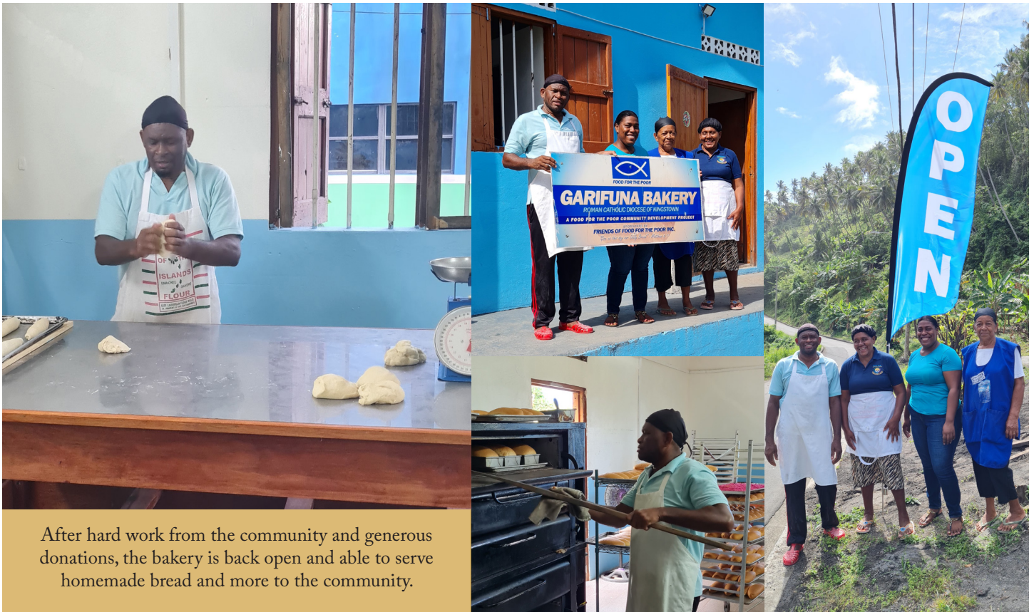
After hard work from the community and generous donations, the bakery is back open and able to serve homemade bread and more to the community.

Passersby began to wonder if the bread was ready. Soon, they were told. “When?” Soon come, in common parlance, soon come. As they waited and hoped, the exterior and interior of the building received fresh coats of paint. Clean up of the yard, especially in the back where water raged and left an indelible mark, continued. And, a deep trench was dug so as to divert further water from wreaking more havoc to the building. Final touch-ups here and there were also in the works. Opening day was, perhaps, just around the corner.