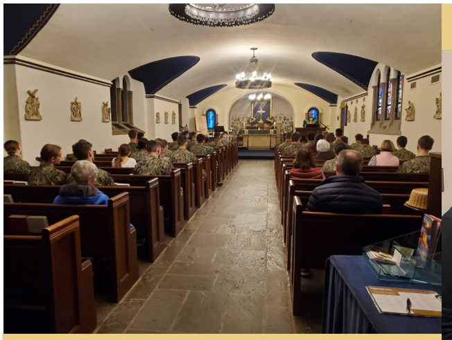
Daily Mass in the lower Chapel, St. Andrew's Chapel, at the USNA

Catholic campus ministry at the U.S. Naval Academy (USNA) is much the same as campus ministry at any college or university. The difference is that the young men and women attending the USNA are also members of our nation's military. The Midshipmen (please note: not Cadets!) at the Naval Academy are there because they want to be future officers in the Navy and the Marine Corps.