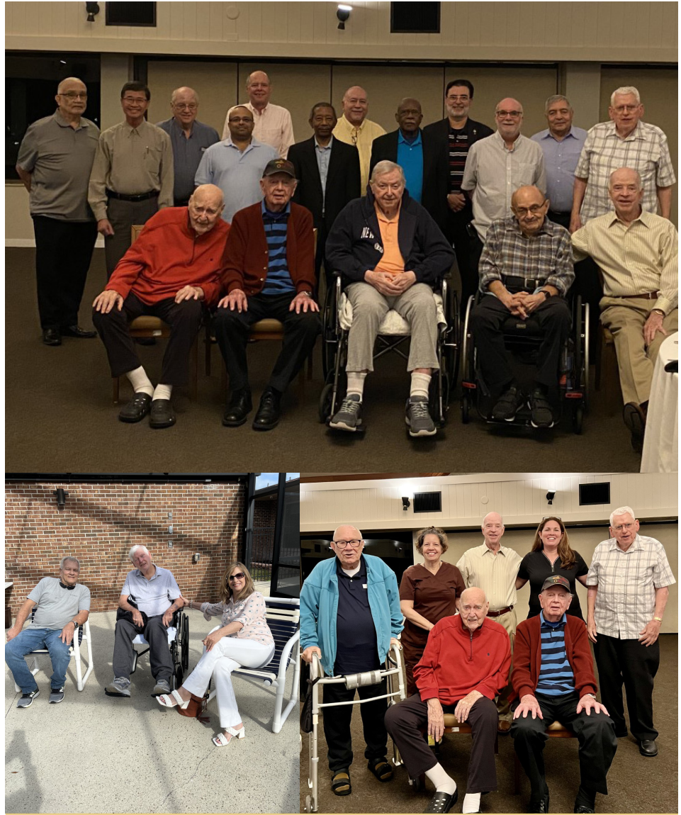
Redemptorist Jubilees were celebrated in February 2023 at Saint Alphonsus Villa in New Smyrna Beach, FL.