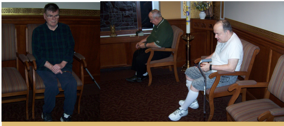
The men at St. John Neumann Residence enjoy daily Mass together.

It is truly inspirational to see more than half of the community at prayer.