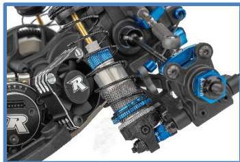
FT Inverted Rear Shock Standoff Set