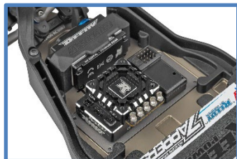
7075-T6 Aluminum Chassis with Optional Weight Plate Pockets (Aluminum plate included with both kits)