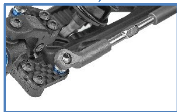
3.5mm Turnbuckles and Ballcups