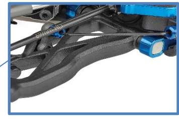
Front and Rear Anti-Roll Bars and hardware