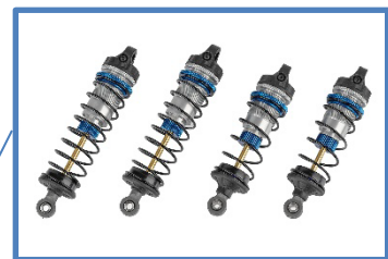
13mm Big-Bore Shocks