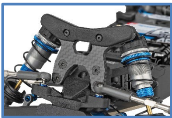
NEW -2mm Front Ballstud Mount included along with updated Top Plate and Standard Ballstud Mount