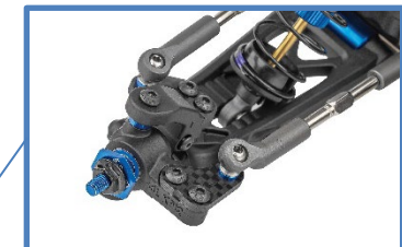
NEW Steering and Caster Block Assembly simplifies assembly and reduces weight without sacrificing tunability