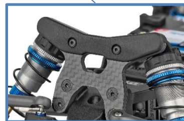
Shock Tower Covers Front and Rear