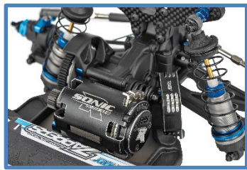
3-Gear Laydown Transmission that maintains original B7 motor position while reducing rotational weight and drag