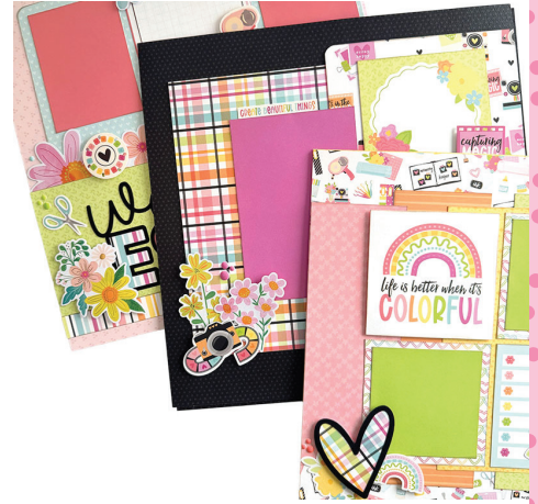
Photo Sizes: Pg 1-(2)3x4, (4) 4x4; Pg 2-(1)4x6, 4x4, 3x4, 6x4, 3x3; Pg 3-(2)

This colorful layout class is packed with crafty stickers, patterns and phrases—perfect for showcasing a weekend crop, crafting with friends or documenting you in your craft space. Featuring Echo Park's Craft Room collection, we'll create two double page layouts, back cut files and layer pretty florals. You'll go home with materials for TWO bonus single page layouts to complete on your own. Let's get crafty! Supplies List: Trimmer, scissors (regular & fussy cutting), tape runner, foam squares, liquid adhesive, ruler, pencil. Optional: Black ink for edging.